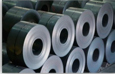
Hot rolled steel coil (black)